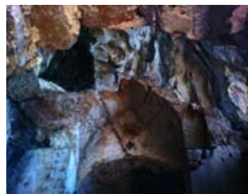
Zmajeva Špilja: Chapel of Immaculate Conception

triarchal society, which is particularly tangible on Croatian islands.