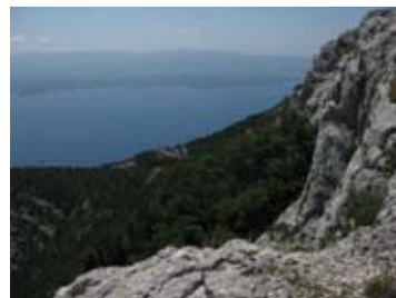
View from Vidova Gora

Following Christianisation, the cave became home to Glagolitic monks in the 11th century. Around this area, another four monasteries, three of which were for nuns, were constructed in the 15th and 16th centuries. Through their leadership and priesthood, men have been dominating spiritual life for milenia, and thus have established a pa-